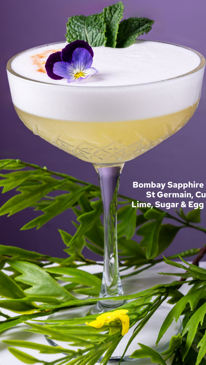
Bombay Sapphire Sunset Gin, St Germain, Cucumber, Lime, Sugar & Egg White - 10.5