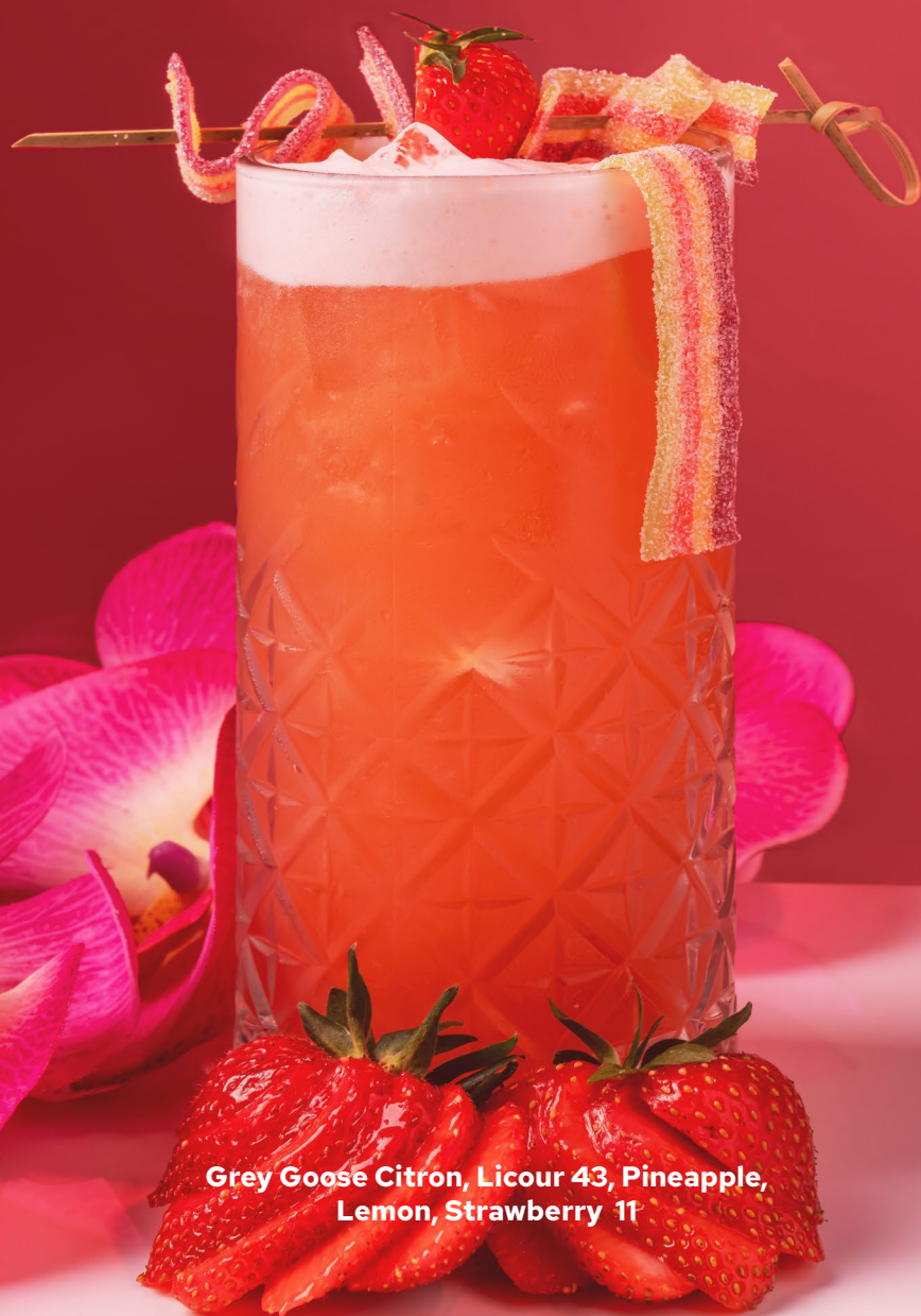
Grey Goose Citron, Licour 43, Pineapple, Lemon, Strawberry 11